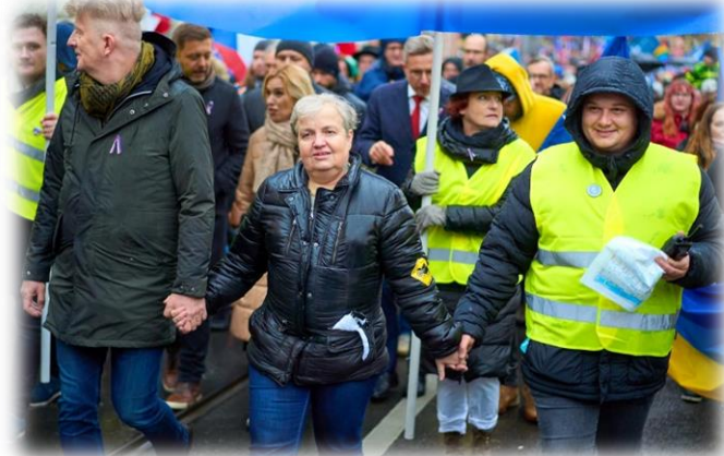
Walks with well-known people