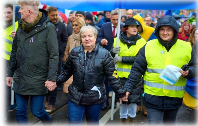
Walks with well-known people